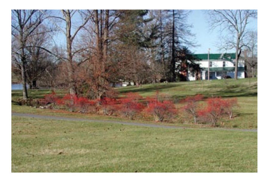
Ilex vomitoria* (Yaupon holly) is adapted to both dry and wet soils. Like other hollies, it is susceptible to scales and sooty mold. I. vomitoria is suitable for Zones 7-9. There are several cultivars, which vary in size and form. Pictured here is the dwarf cultivar 'Nana'.