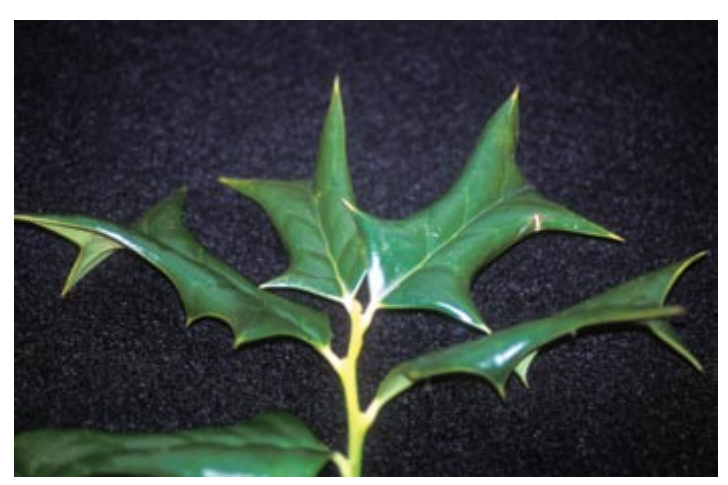
Ilex verticillata* (winterberry) does well in both heavy and light soils, but is native to swampy areas and prefers moist, acid soils high in organic matter. It produces persistent red berries that are a nice accent to the winter landscape. At least one male plant must be planted among female plants for fruit production. The cultivar 'Winter Red' is a prolific fruit-producer. Compact, dwarf cultivars, such as 'Red Sprite,' are also available.