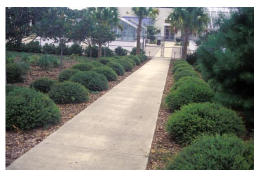
<sup>1</sup> Although both I. cornuta and I. vomitoria are susceptible to scales and sooty mold, they are included because few other evergreen shrubs are listed and these species of Ilex do perform well in many landscapes.

Juniperus chinensis (Chinese juniper) is a large shrub or a tree. Like all junipers, it needs full sun. Many cultivars are susceptible to the fungal diseases, Phomopsis blight and Kabatina tip blight, but some cultivars, such as 'Keteleeri,' 'Pfitzeriana' (pictured left), 'Pfitzeriana Aurea' (middle photo), var. sargentii, and var. sargentii 'Glauca' have resistance to these diseases. The upright cultivar pictured on the right is 'Torulosa.'