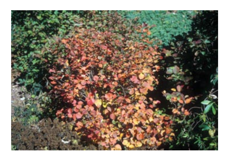
Fothergilla major (large fothergilla) is a rounded, multi-stemmed shrub that has exceptional fall color and essentially no disease problems. It must be planted in acid soil and does not do well in dry soil. (no photograph)

Hydrangea arborescens* (smooth hydrangea) is a low-growing, native shrub that produces pretty white flowers in July. It prefers partial shade, but can be grown in full sun with