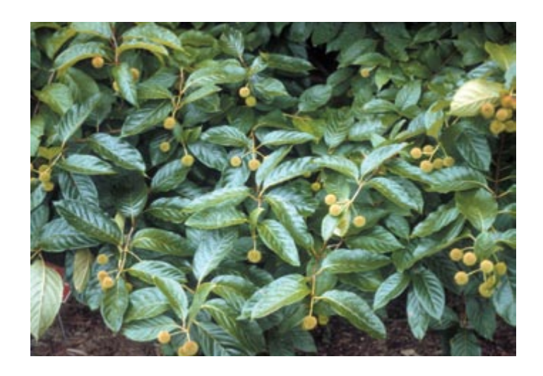
Clethra alnifolia* (sweet pepperbush) is tolerant of wet soils. It tends to form colonies slowly, and the cultivar 'Sixteen Candles' remains compact. Its very fragrant white flowers open in July. Pictured here is the pink-flowered cultivar 'Rosea'.